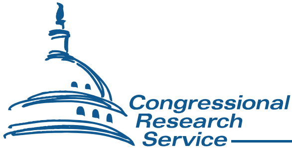
Table Egg Production and Hen Welfare: The UEP-HSUS Agreement and H.R. 3798